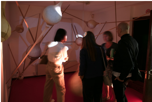
Ripe Bananas #02.

“Opening night for Ripe Bananas #02 at @aspacearts new space The Alfred Arcade. Arts group ‘A Space’ are creating amazing opportunities for artists in Southampton at the moment, graduate and emerging artists alike.”