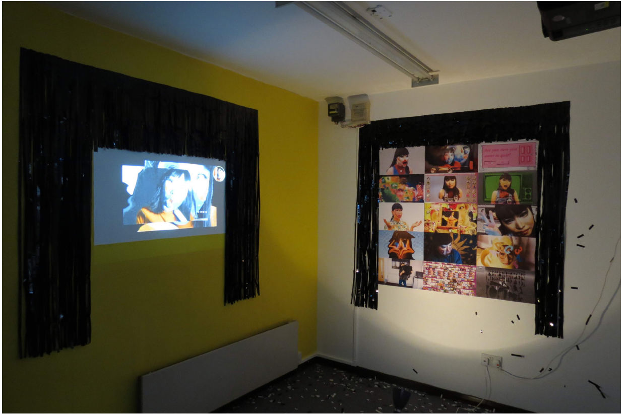
Work by Grace Payne.