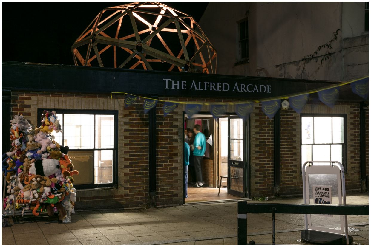
Alfred Arcade.

Our next project at the Alfred Arcade, Banana Bread, is a short-term residency programme that aims to encourage artistic and professional development through skills-sharing workshops and opportunities. For three weeks, seven of the fourteen 'Ripe Bananas' will have access to a studio space for artistic experimentation and production. During the course of the residency, a number of workshops will take place, lead by the participating artists. The outcomes of these workshops will then be exhibited, along with other studio work, for one weekend only in October.