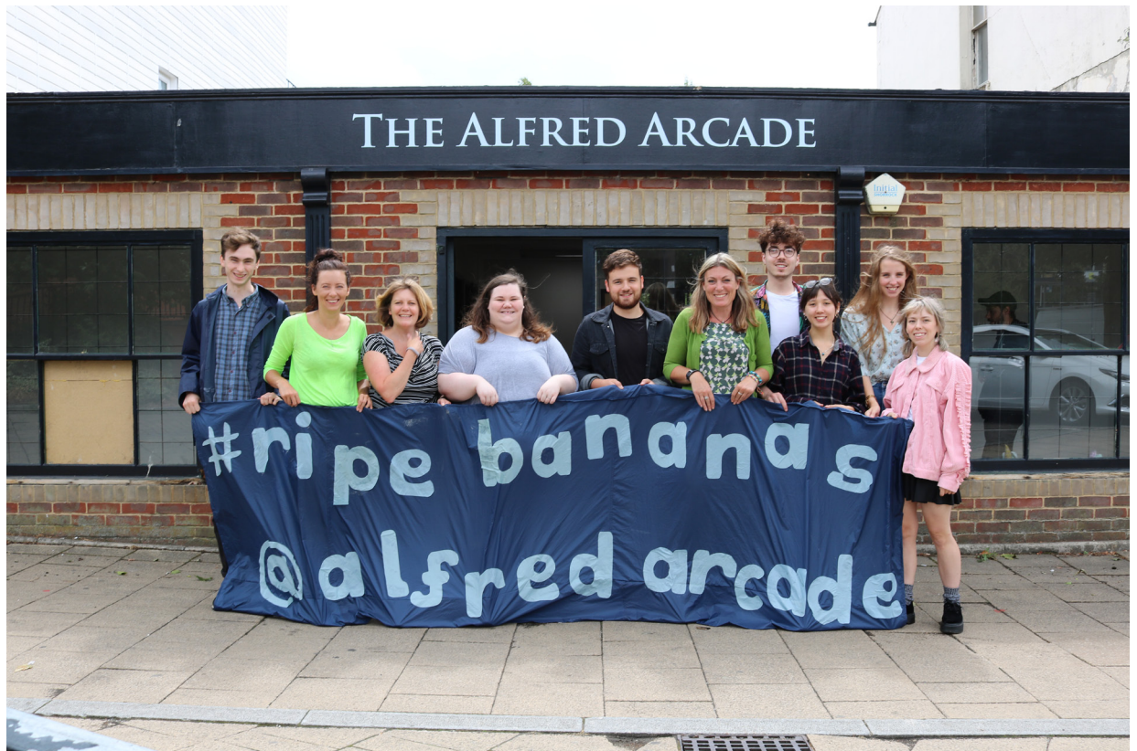
Ripe Bananas artists..

'a space' arts invited seven graduates from SSU and seven from WSA to exhibit at one of two shows that took place in August and September 2018. Ten of the artists were from that summer's graduating cohort and four had graduated in 2017 and were a year into their professional practice.