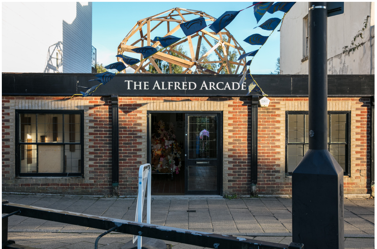
Exterior of the Alfred Arcade.