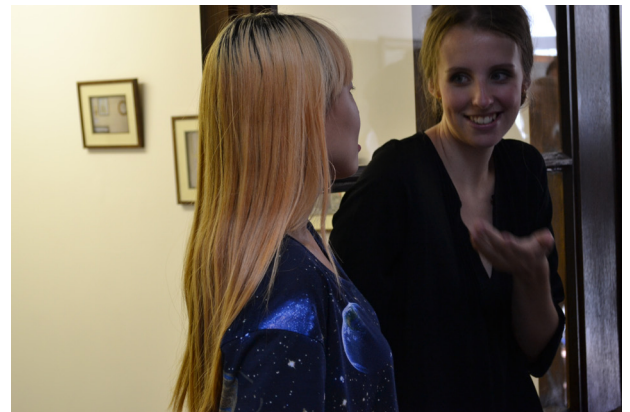
Ripe Bananas #01. Photo credit: Ian Delve

Ripe Bananas with this gal @peach_art101 was incredible from set up to opening night, so grateful I could be part of the project!