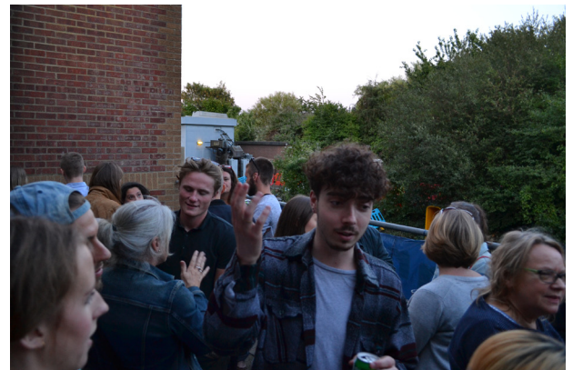
Ripe Bananas #01.

“@aspacearts Ripe Bananas #1 project is amazing, with graduated artists from @wsa_ba and @solentuniofficial”