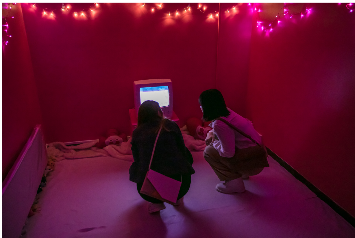
Work by Bethany Luxton.