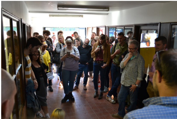
Ripe Bananas #01.