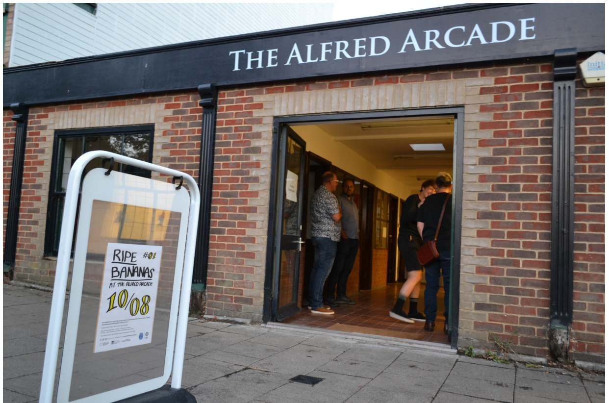
The Alfred Arcade.