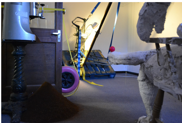
Ripe Bananas #01.

“Brilliant evening! Awesome space and a terrific show”